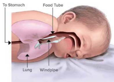
Babies choke when food gets in the windpipe.