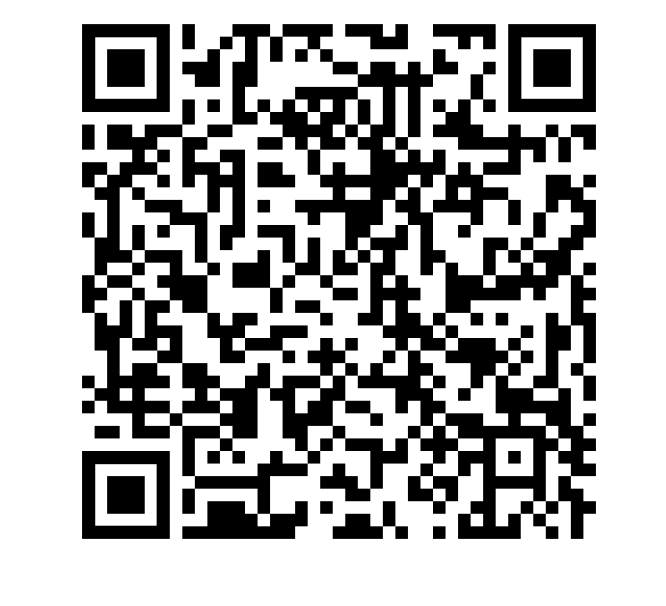
Download the resource here